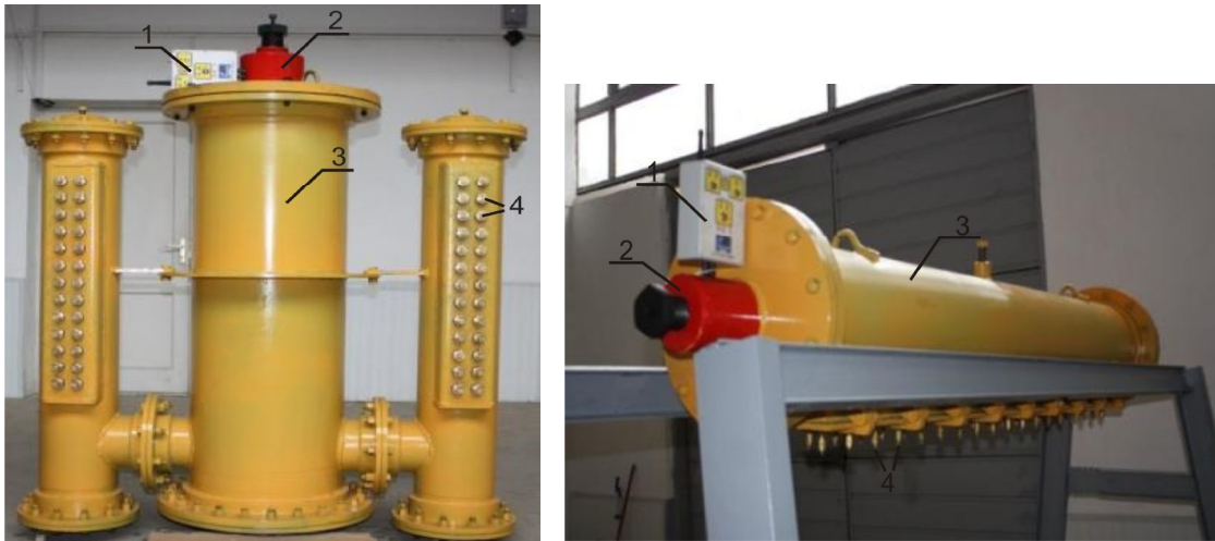
Test samples of an absorber. A – for horizontal dispersal, B – for vertical dispersal.

1 - absorber control block, 2 - pyrotechnic device, 3 - water container, 4 – nozzles