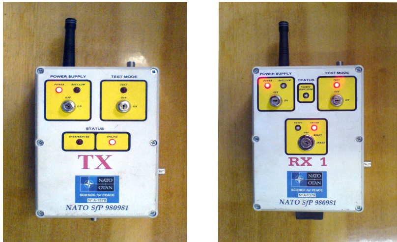
Photos of modules of wireless system for the detection of explosions and activation of an absorber. TX – Transmitter module, RX1– Receiver module.

www.mining.org.ge/Projects/SFP980981.htm